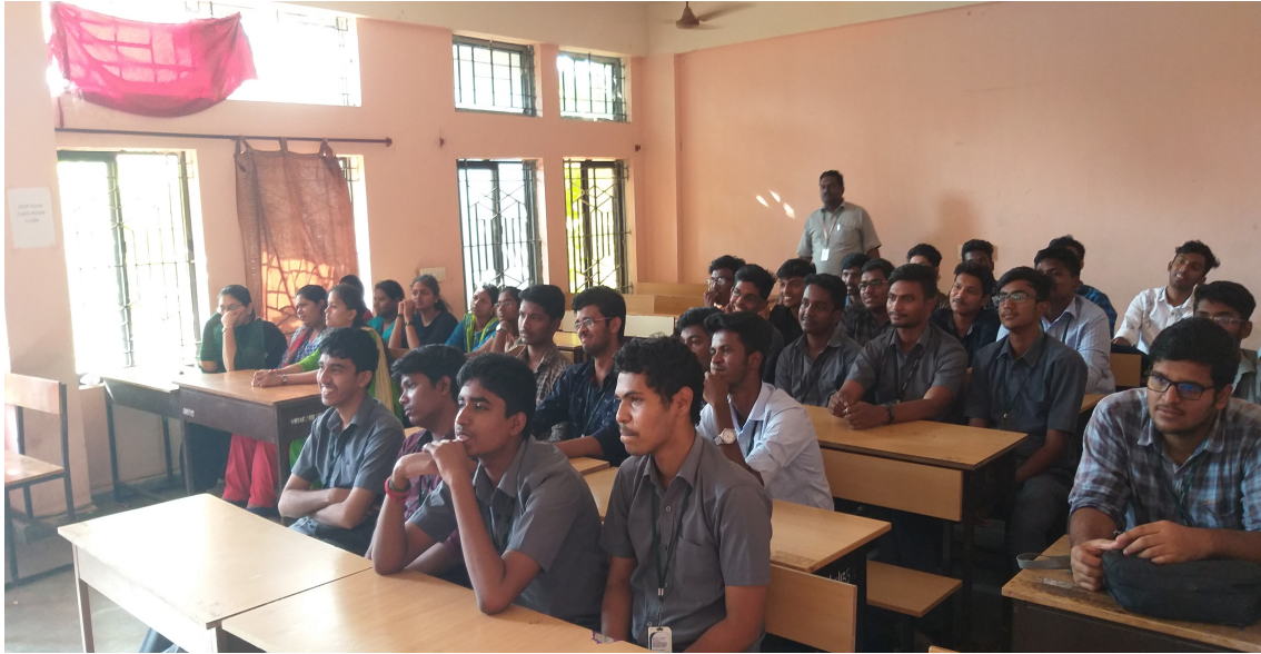
Students witnessing the videos

Also, as a part of EBSB Day event, the following information regarding kidney health has been discussed with the students.