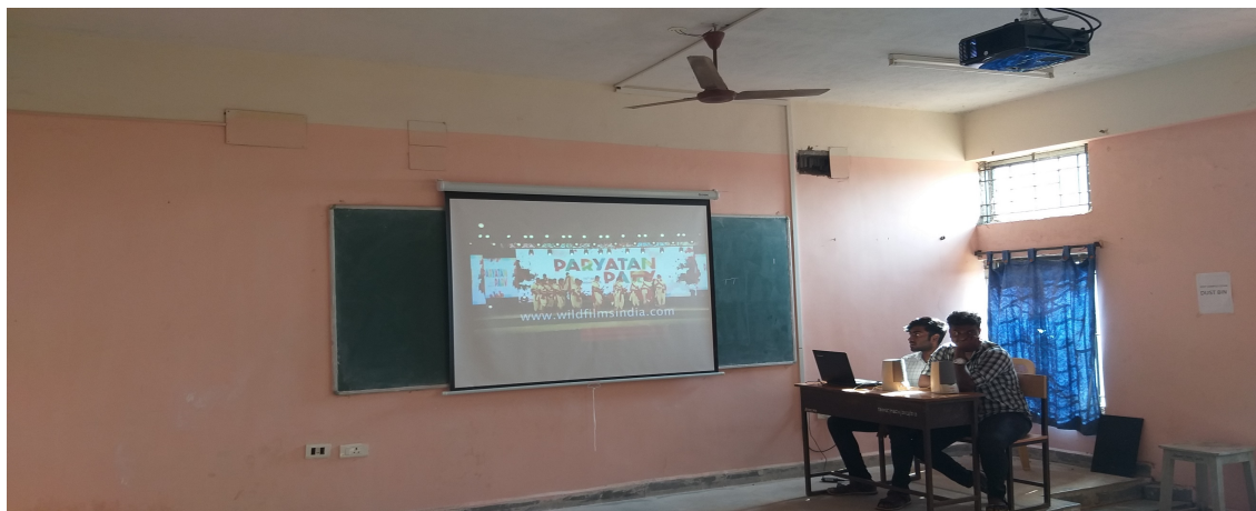
Folk Dance Video

EBSB day was celebrated in Sri Manakula Vinayagar Engineering College on 14 th March 2020. In this occasion, 2 videos were played. The first video portrays the Folk Dance practiced in the paired UT, Daman. The second video was about the important places to visit in Daman. The students felt both the videos as informative and they had a virtual experience of the union territory.